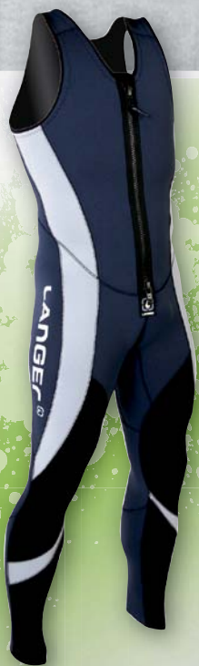
Langer Long John Dream High performance neoprene wetsuit.