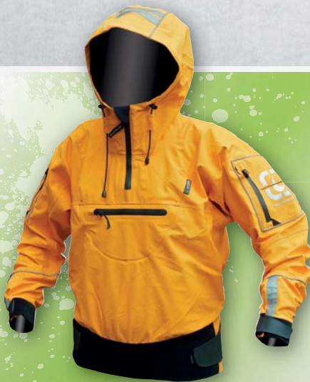
Langer Long Salt Pro Versatile touring jacket.