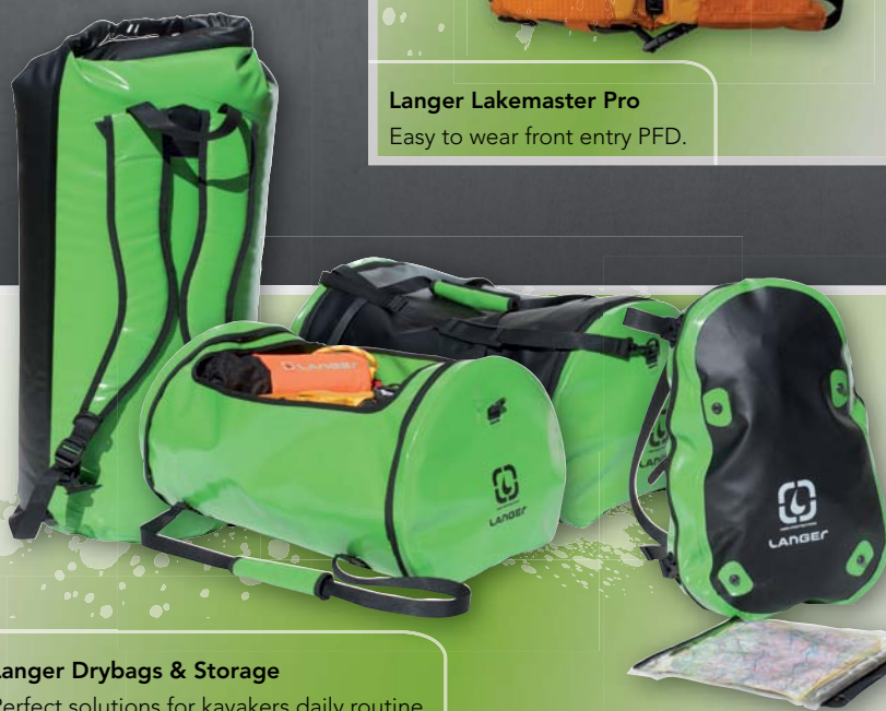
Langer Drybags & Storage Perfect solutions for kayakers daily routine.