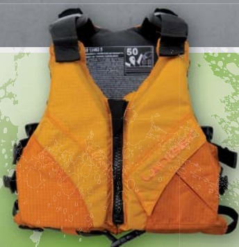
Langer Lakemaster Pro Easy to wear front entry PFD.